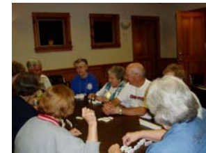
We Have Fun

We will bring a group of 25-30 workers to your Camp or Conference Center to arrive on Sunday afternoon and leave on Saturday morning with Wednesday afternoon off. We expect free lodging and a negotiated price for our meals. Supplies and large or unusual tools will be furnished by the institution. MIMers will bring their own hand tools.