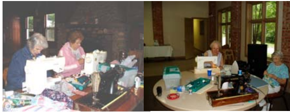
Sew Curtains and Goodie Bags