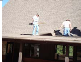
Limited Amount of Roof Projects