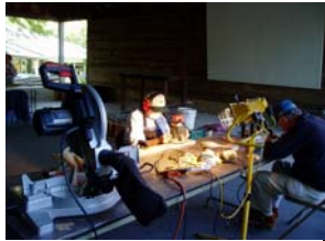
Great Sign Makers