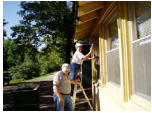
Paint Inside and Outside