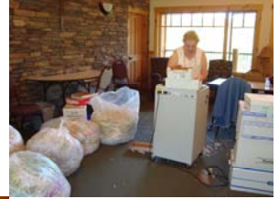
Jobs No One has Had Time to Do